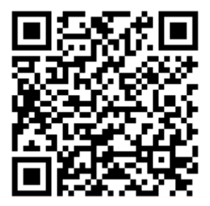
Technical Sheet > Villa in a dominant position in Roussillon > 450.000 euro

edith.ffimmobilier@gmail.com - 06 80 11 35 20